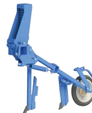
ScariTILL Tine Frame Mounted Presswheel

Producer Proven & Built to Last... Because it's Gason!