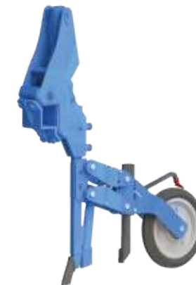
HydraTILL Tine Parallelogram Presswheel

Holes in pivot assembly and tines allow vertical adjustment in 12mm increments and easy changeover of shanks.